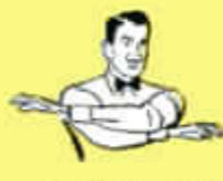
Incomplete forward pass. No penalty.