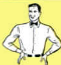
Offside. 5 yards.