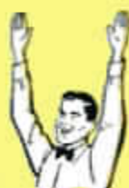
A score. Have a Pepsi.