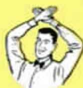
Time out. Have a Pepsi.