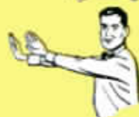
Defensive Holding 5 yards.